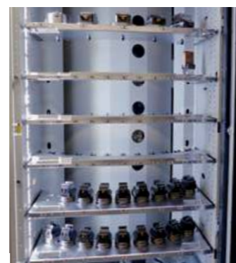
A small challenge for Fehlmann: 320 x 320 UPC pallets, ITS 85 and 148 as well as electrode holders are used.