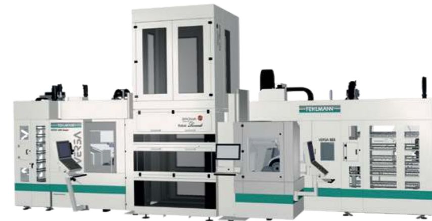
5-axis machining cell with FEHLMANN multi-machine automated solution for machining sophisticated, precise workpieces around the clock.

Dear customers, you place your trust in us every time you invest in a new FEHLMANN product. We are deeply grateful for this and want to thank you – especially in this year of our anniversary, 2020.