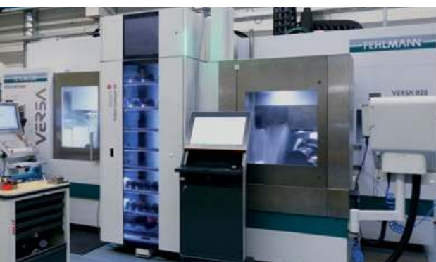
The machine configuration was planned this way from the start. Investments in the VERSA 645 linear were made in spring 2018 and this was supplemented with the VERSA 825 in October 2019.