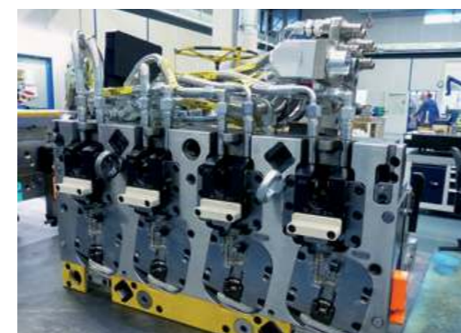
These are often highly complex workpieces for which tolerances of 1/100 mm are specified. This means that precision is the main focus at WESKO.