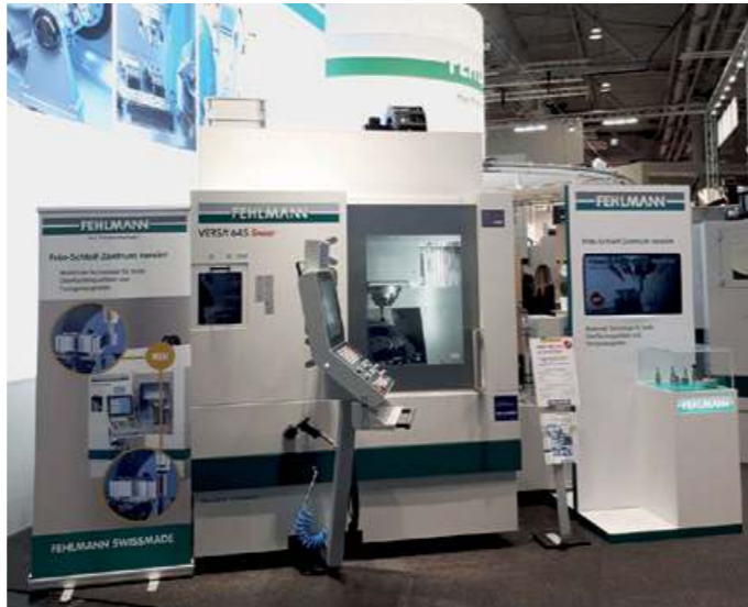
Presentation of the milling-grinding center at the EMO 2019.