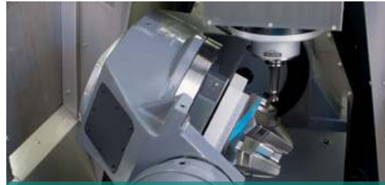
Machining centers in portal design