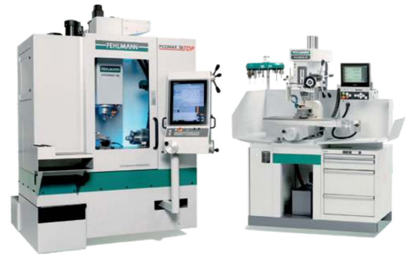
FEHLMANN series PICOMAX milling/drilling machines for easy, efficient production of individual parts and small series.