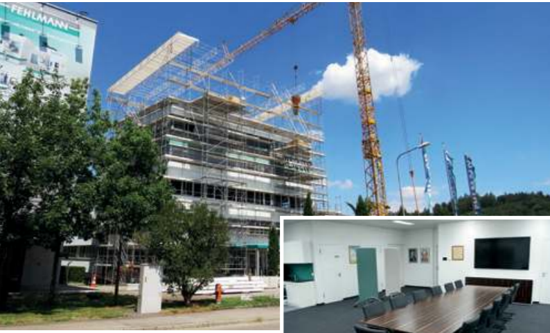
Renovation of the facade on the south side.

FEHLMANN is strengthening the foundation of its Seon location with ongoing investments, modernisation and expansion. A lot has happened in the past two years: