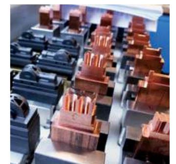
The two machining centers are utilized 30 percent with the milling of copper electrodes. Independently of this, WESKO also manufactures graphite electrodes, but on a different machine.