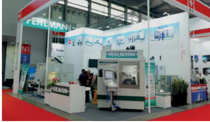
Swissness at the FEHLMANN exhibition booth at the CCMT 2018 in Shanghai.