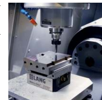
The linear drives not only achieve faster traversing movements, but also allow more precise imaging in corner areas. Tolerances of 1/100 mm are thus achieved reliably and permanently.