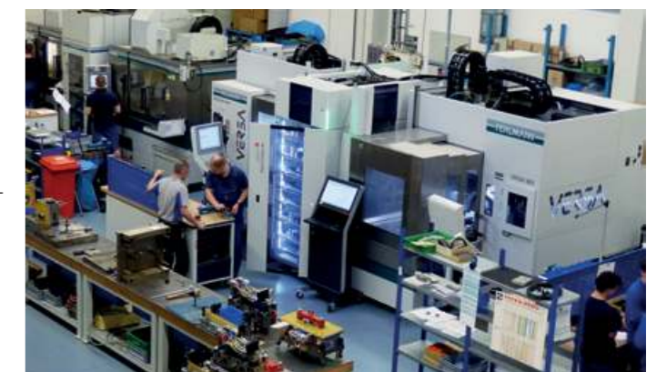
The decisive criteria for the machining cell were compactness and the operator's ability to always have an overview of both machines.