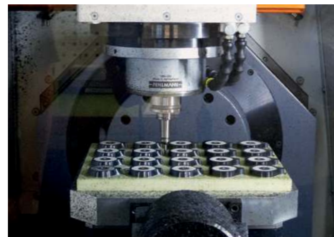
The two machining centers now allow the company to operate at the highest level in terms of dynamics, feed rate and stability.