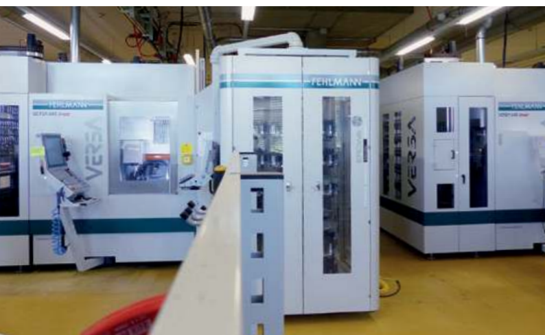
In 2018 the company invested in the first VERSA 645 linear 5-axis machining center, followed by the second in 2019. Both machines are connected with a Robot Multi (ERM) from Erowa.

Read about other interesting customer experiences in the section «Media» on www.fehlmann.com .