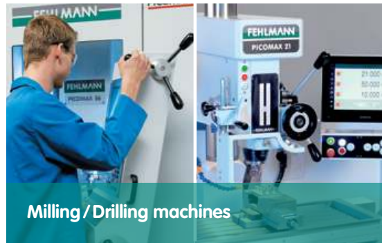
Milling / Drilling machines