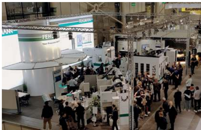
A concentrated charge of precision machine tools at PRODEX 2019 in Basel.