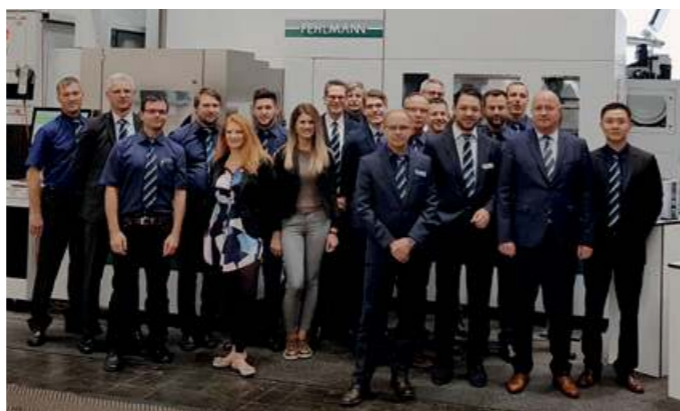
A knowledgeable trade fair team provides customers with expert professional advice that is geared to their needs.