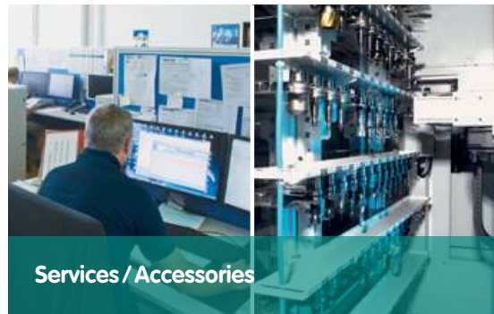
Services / Accessories