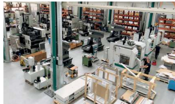
Precision parts are manufactured and assembled to the ISO 9001 quality standard in the air-conditioned production halls.

The challenges of the 90's: high-speed cutting (HSC), 5-axis milling, automated solutions for individual parts and small quantities. Together with customers in mold and tool production, as well as in parts manufacturing, Fehlmann AG brought the perfect solutions to the market and continued to develop them further. These solutions continue to meet the highest standards, even today. In 2005, the FEHLMANN technology center was opened. This building project was unique in Switzerland – fully air-conditioned and built to the latest technical