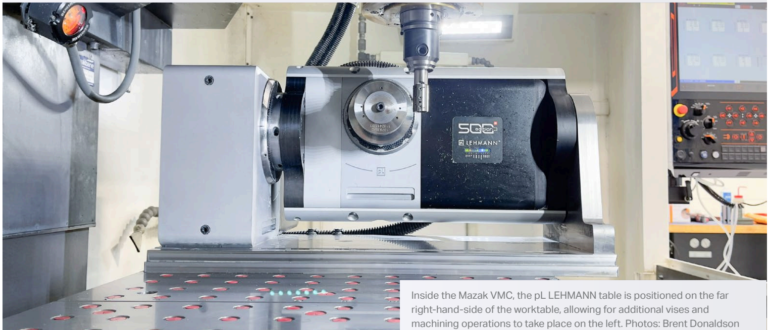
Inside the Mazak VMC, the pL LEHMANN table is positioned on the far right-hand-side of the worktable, allowing for additional vises and machining operations to take place on the left.

For Fischer USA, 3+2 machining with a high-precision rotary table adds flexibility without the cost of a full five-axis machine.