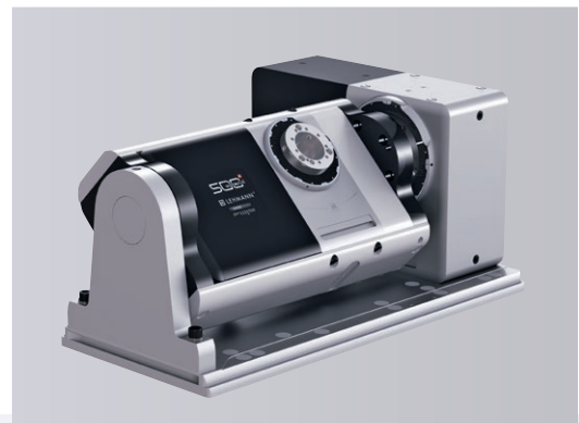
TAP2 rotary table from pL LEHMANN.